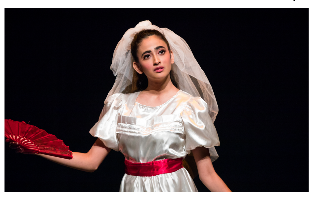
Major Spoiler Warning:

Lila is a young girl from a far-off village who has come to Canada to find a husband to buy her.